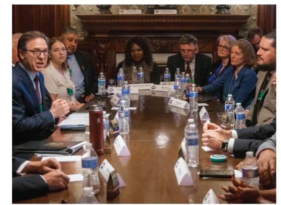
The CWA Broadband Brigade members met with high-level officials in charge of decision-making for the build: Mitch Landrieu, Senior Advisor and Infrastructure Coordinator; Don Graves, Deputy Secretary of Commerce; and Alan Davidson, Assistant Secretary of Commerce for Communications and Information and the person in charge of BEAD funding.